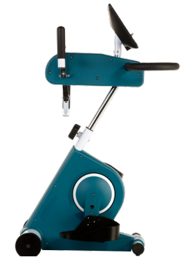
LOWER TRAINER MODE