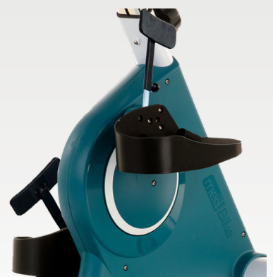
20408 Calf Support