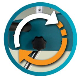
TWIST & TURN