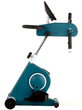
UPPER TRAINER MODE